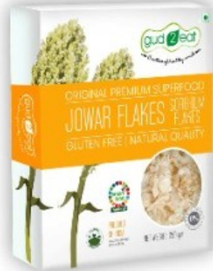
Jowar Flakes ▶