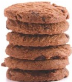
◀ Ragi Cookies