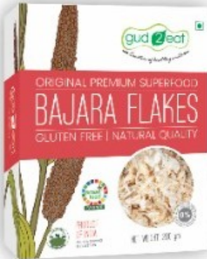
◀ Bajara Flakes