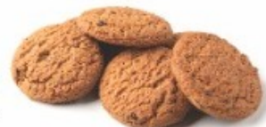
Multi Millet Cookies ▶