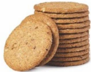
Jowar Cookies ▶